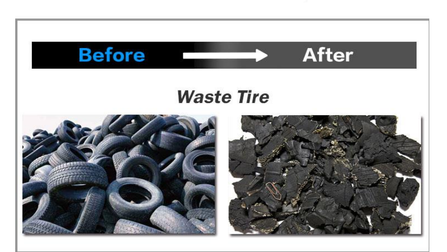
Figure 1. Whole tires before and after they are shredded into TDA (Wanrooe, 2019).

TDA is mostly made from Passenger and Light truck tires (PLT), however Off-the-Road tires (OTR) are also used (Meles et al., 2014). In fact, OTR tires are sometimes preferred because the TDA from these thicker tires produce TDA that is more similar in particle size and shape to conventional aggregate (Meles et al., 2014).