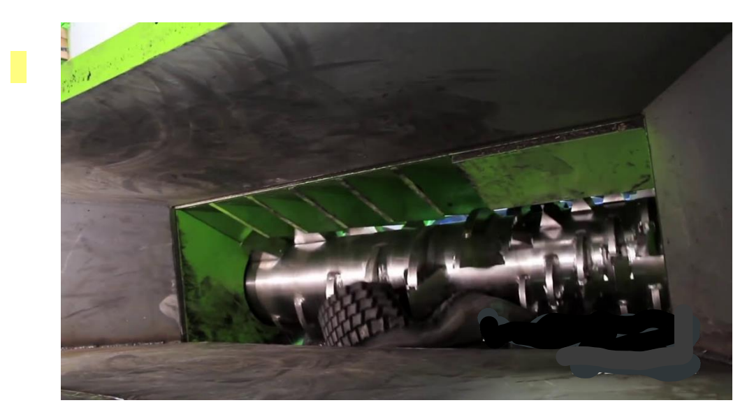
Figure 2. A single shaft tire shredder.

Scrap tires are fed into the hopper and pushed towards the cutting shaft by a hydraulic-driven arm to ensure they are properly shredded by the rotating cutting blades. The tires are continually shredded until the shreds are small enough to pass through the screen mesh, creating a TDA product that is even in size (Ningbo Sinobaler Machinery Co., Ltd., 2015). The single shaft shredder shown in Figure 2 is designed to process up to 12 tons of scrap tires per hour.